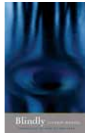
Blindly by Claudio Magris translated by Anne Milano Appel (Yale University Press)